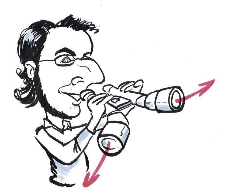
BEYOND GDP INDICATORS = MULTI VISION

What are the biggest challenges, essential to solve in the short or long term, to enhance the use of alternative indicators in policy making?